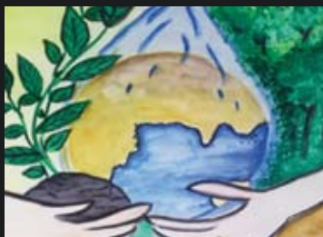
World Environment Day at Lanjigarh and Jharsuguda