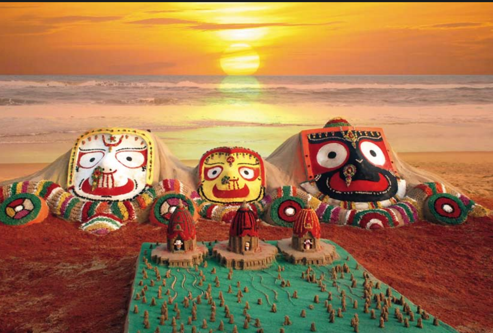
Sand sculpture by Sudarshan Pattnaik