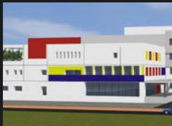
Jharsuguda Hospital: A boon for Western Orissa