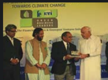
Vedanta recognized as the 'Green Leader'