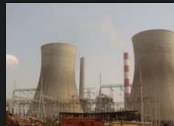
First boiler of 2400 MW Independent Power Plant ignited